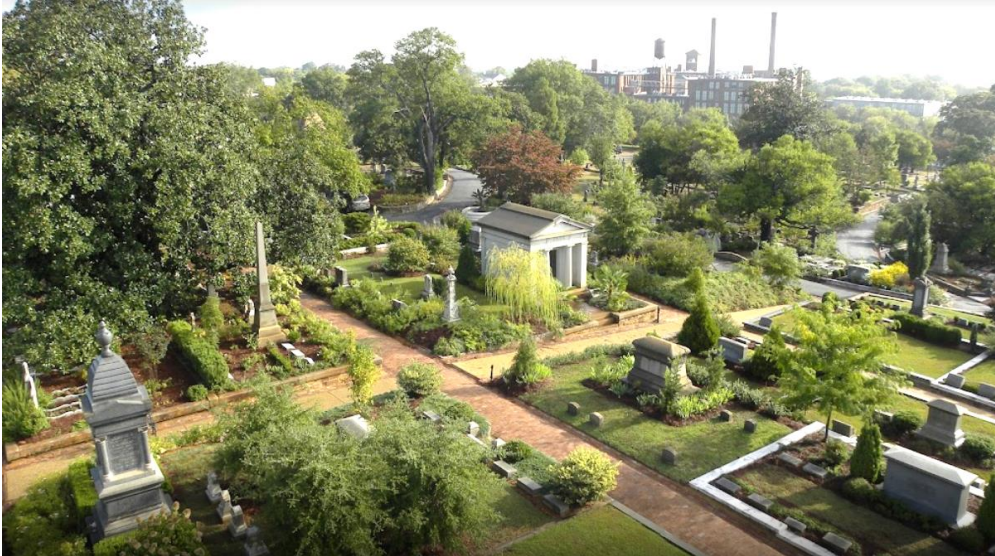
Oakmont Cemetery, Atlanta, GA