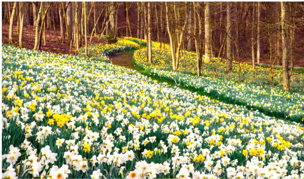
Gibbs Farm Daffodil Garden

Then Saturday to Monday is serious work for all delegates and visitors as we plan next year's progress for NAGC. Don't forget items for the auction. Many corms will be available but other items can be donated to create excitement.